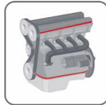
Bonding and sealing of pipe threads