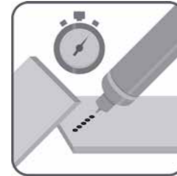
Structural bonding with media resistance