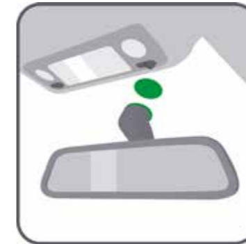
Sealing of flange connection