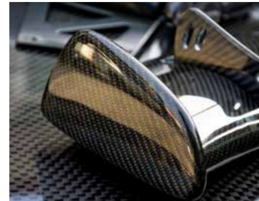
Composite & Composite