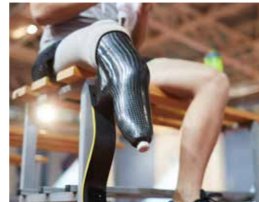
Composite & Plastic